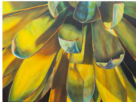
Realism Basics in Oils with Patrice Al-Shatti Saturdays, Apr 8 - 29 | 10 am - 3 pm