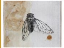
"A Song of Alimentary Sorrow" by Beth Shock