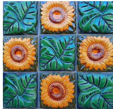
Creating Ceramic Tiles with Elizabeth Behnke Fridays, March 10 - April 14 | 1 - 4 pm