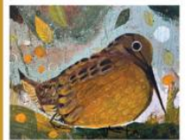
"The Woodcock" by Lynne Arvid