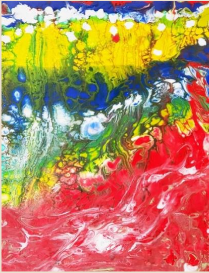
Acrylic Pour with Bela Fidel Thursday, Sept. 1 1 - 4 pm