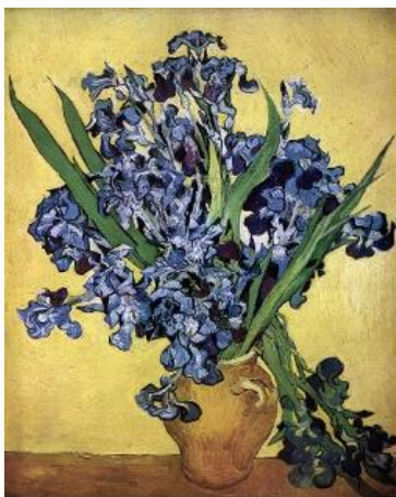
Vase with Irises Against a Yellow Background, 1890, oil on canvas

It is August in Arizona! And while it is certainly a time of year many of our visitors avoid, the best part about living in or visiting Arizona is that there's never a wrong time to be here, weatherwise. If it's too hot down south, you can head north for cooler temperatures, and vice versa. Yet regardless of where you are, in Arizona or in another state or country, you can always access the Shemer Art Center, either for a virtual class or through our mobile app! And if you are here in Phoenix, you can view, in person, a great art exhibition or see the new items in our gift shop, and you can always find out more about our upcoming activities!