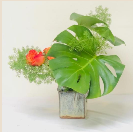
CERAMICS & IKEBANA with Ping Wei Fridays, Sept. 9, 16 & 23 1 - 4 pm