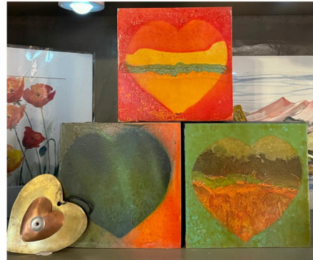
Wood Cube Hearts $160 - $200

Give The Gift of Art this Valentine's Day!