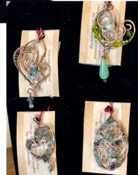
Hand Formed Copper Scrolls Pendants with Swarovski Crystals & Czech Glass $38 - $68