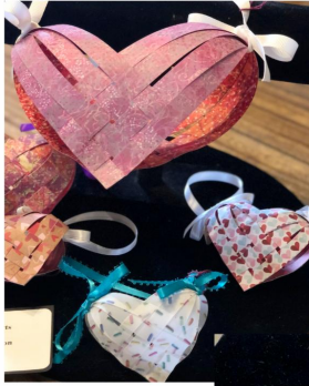
Woven Paper Hearts $5 - $15