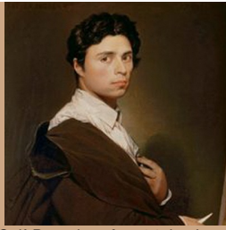
Self-Portrait at Age 24, by Jean-Dominique Ingres