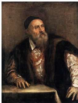
Self-Portrait by Titian, 1562-64, oil on canvas, Staatliche Museen, Berlin