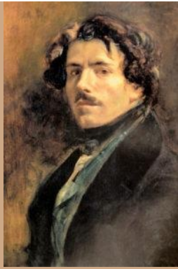
Self-Portrait with Green Vest, by Eugene Delacroix