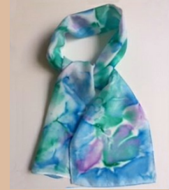
HAND-PAINTED SILK SCARVES with Barbara Tibbets

For more details about these and other workshops, click HERE!