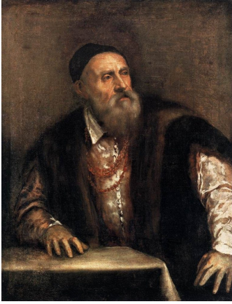
Self-Portrait by Titian, 1562-64, oil on canvas, Staatliche Museen, Berlin