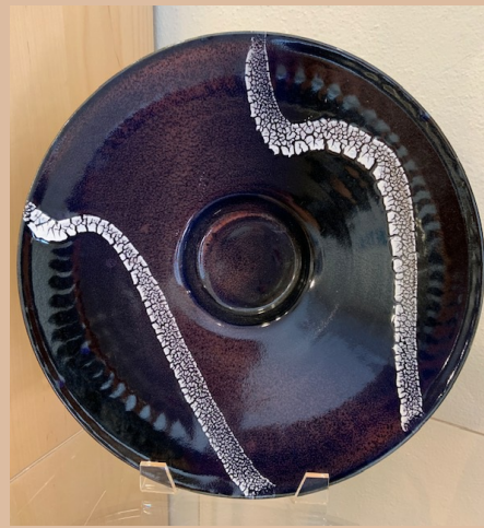
Red/Black w/ White Cracker Glaze Porcelain Ceramic by Stephen Bunyard

If you are looking to impress your guests during their next visit to your home, check out this beautiful porcelain ceramic platter by Stephen Bunyard! Now available in our gift shop, this platter sitting on your kitchen island, is sure to elevate your next dinner party conversation!