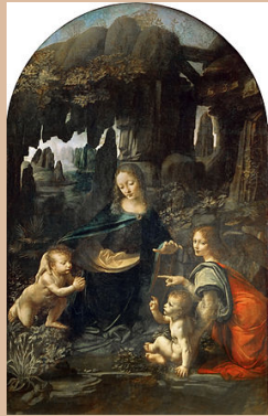
Madonna of the Rocks by Leonardo da Vinci, 1483-1506, oil on panel, transferred to canvas, Louvre, Paris