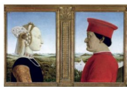
Portrait of Federico da Montefeltro and his Wife Battista Sforza by Piero della Francesca, 1465-66, Uffizi